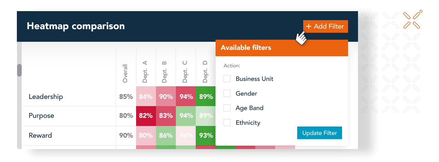
Fig 2: The survey dashboard helps you compare results using multiple filters, so you can identify areas that need attention. The above example is illustrative and not indicative of Zeelo's results.

A few clicks on the dashboard revealed which factors were driving some lower scores at the business area and department levels. These results were further explained by using the open-text comments to dig deeper into department level themes such as communication, decision making and growth.